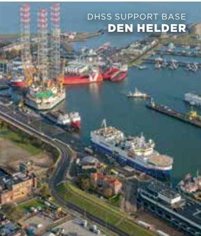
DHSS SUPPORT BASE DEN HELDER