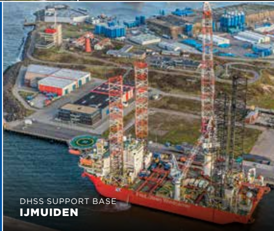
DHSS SUPPORT BASE IJMUIDEN